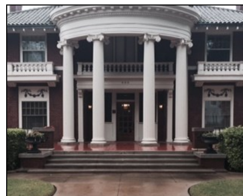
The Historic Rogers House