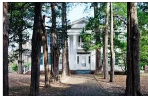
The home of William Faulkner