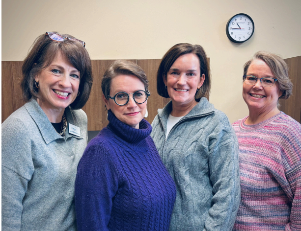
LifeQuest staff pictured left to right:

Located within Second Presbyterian Church, the LifeQuest Office is open Monday - Thursdays, 9:00 a.m. - 4:00 p.m.